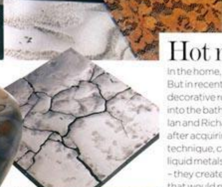
Left, Based Upon's limited edition Pantone chair. Above, a cracked-effect metal floor tile. Below, the duo's gallery space features columns designed for the new Nobu and their "Evolving Floor" (from £300 per sq m)