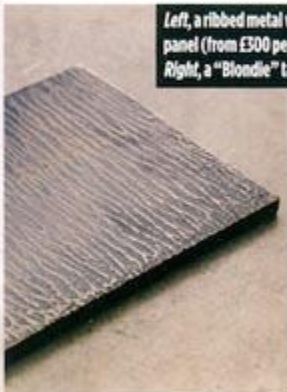
Left, a ribbed metal wall panel (from £300 per sq m). Right, a "Blondie" table top

In the home, it was once confined to utilitarian purposes. But in recent years, metal has taken on an increasingly decorative role, gradually making its way from the kitchen into the bathroom, living room and beyond. A year ago, twins Ilan and Richard Abell set up their company BASED UPON after acquiring sole European rights to a revolutionary new technique, called Axolotl Metal. Using room-temperature liquid metals that can be sprayed on to any surface - even lace - they create fluid organic forms, colours, textures and alloys that would previously have been impossible. Look out for their luxurious textured wall panels and limited edition versions of classic chairs such as the Pantone. Recent projects include working with David Collins on the new Nobu in Berkeley Street, where gold stairways lead to rooms lined with burnt wood panels infused with silver-steel, and vast curving columns that fade seamlessly from gold to silver. They have also just launched their first retail product: the Evolving Floor is a metal floor, based upon traditional wooden flooring, that wears with time through to layers of different metals. Based Upon can also be commissioned for bespoke residential projects, and has undoubtedly opened up new avenues in the world of interior design. Basedupon.co.uk ; 020 8320 2122