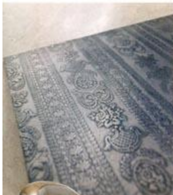
Above, one of Based Upon's textured wall panels (from £300 per sq m). Right, experimental finishes